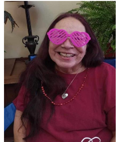
Residents loved their Valentine Gift Bags